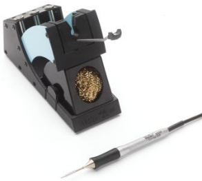
WXMP set with safety rest WDH 50

Order No. 0052920699 (0052920599 for pencil only)