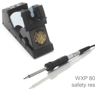
WXP 80 set with safety rest WDH 10

Order No. 0052921299 (0052921199 for pencil only)