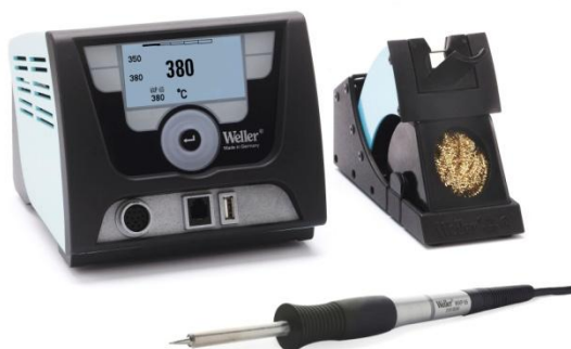
WX 1 control unit with WXMP Micro soldering pencil (40W / 12V) and WDH 50 safety rest