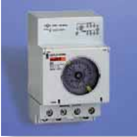
■ Timing applications