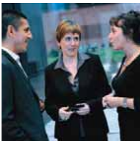
■ Customer needs