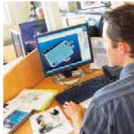
■ R&D department