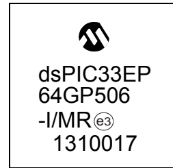
64-Lead TQFP (10x10x1 mm)