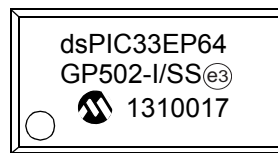
28-Lead QFN-S (6x6x0.9 mm)