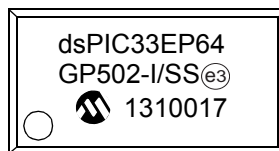
28-Lead QFN-S (6x6x0.9 mm)