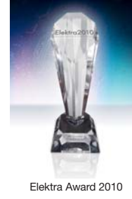
Elektra Award 2010