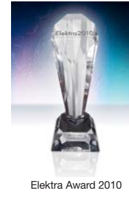
Elektra Award 2010