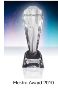
Elektra Award 2010