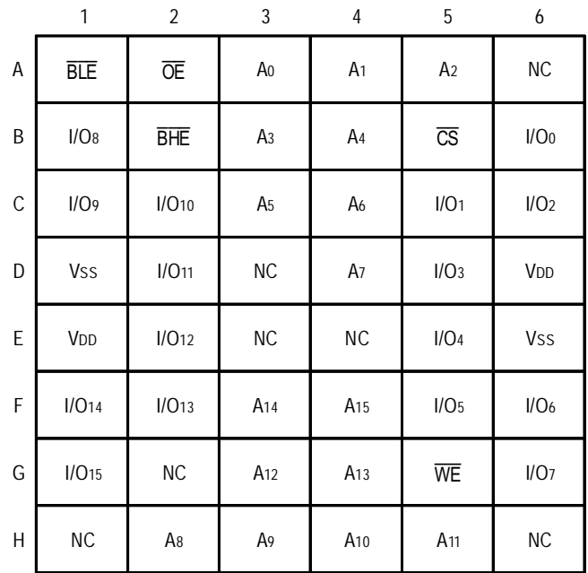
FBGA (BF48-1) Top View