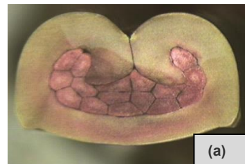
Significant flash can be generated with excessive anvil to crimper clearance, as shown by nominal design condition (a) and +0.003 in over nominal condition (b)

Dimensional control is clearly critical.