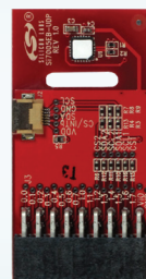
Si7005 UDP DAUGHTER CARD