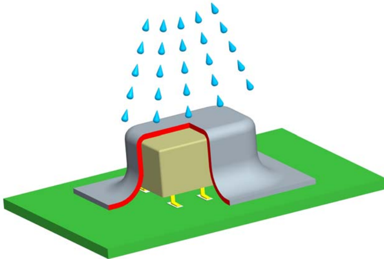
Fig. 4: Coating of relays on PCB's

Suitable are Epoxy, Urethane and Fluorine coatings. Absolutely forbidden are Silicone coatings.