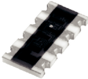
Product may not be to scale

PR arrays can be used in most applications requiring a matched pair (or set) of resistor elements. The networks provide 2 ppm/°C TCR tracking, a ratio tolerance as tight as 0.02 % and outstanding stability. They are available in 1 mm, 1.35 mm and 1.82 mm pitch.