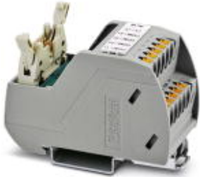
VARIOfACE Professional (VIP) board for the ROC800 controller

Please be informed that the data shown in this PDF Document is generated from our Online Catalog. Please find the complete data in the user's documentation. Our General Terms of Use for Downloads are valid ( http://phoenixcontact.com/download )