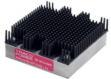
(Models pictured with optional heatsink)

The TEP 160 Series is a family of isolated high performance dc-dc converter modules with wide 2:1 input voltage ranges which come in a rugged, sealed industry standard half brick package.