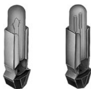
T-1 1/2 Pilot Slide Base

Toggles Rockers Pushbuttons Illuminated PB Programmable Keylocks Rotaries Slides Tactiles Tilt Touch Indicators Accessories Supplement