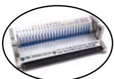
Splice Head 4041-SPL

The 4041-SH is the tool mounting assembly from the 4049-NXG and 4049-R Lite Rigs that holds the 4049-VTB Variable Traverse Brace. It enables the user to position the MS 2 splice head where needed for greater splicing flexibility.