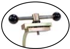
Aerial Strand Clamp 4035-A

Lightweight and hand-operated. When proper crimping pressure is reached, a bypass valve opens.