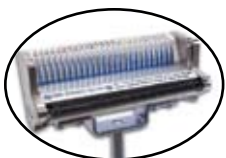
Splicing Head and "T" Bar 4041-P

This assembly contains a splicing head, a pedestal, a traverse clamp assembly with a long bar, and a head clamp for use with two-man fold-back splicing.