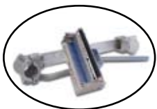
Splicing Head Assembly 4040

A self-contained, pistol-gripped crimper designed to crimp MS 2 modules in the 4041 splicing head.