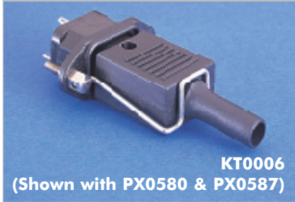
KT0006 (Shown with PX0580 & PX0587)