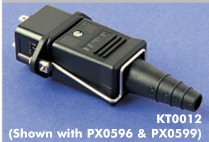
KT0012 (Shown with PX0596 & PX0599)