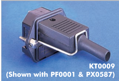
KT0009 (Shown with PF0001 & PX0587)