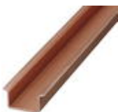
DIN rail, material: Copper, unperforated, 1.5 mm thick, height 15 mm, width 35 mm, length: 2 m

DIN rail - NS 35/15 CU UNPERF 2000MM - 1201895