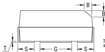
ANODE (+) END VIEW