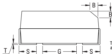
ANODE (+) END VIEW