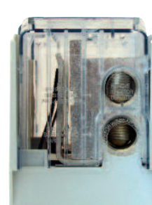
Optional 400A Class J Version (JM60400- MW22)

††For Class J 400A double box lug configuration, optional cover provides IP20 finger-safe protection for dual 350kcmil-1 AWG wires or one single 350kcmil-6 AWG wire.