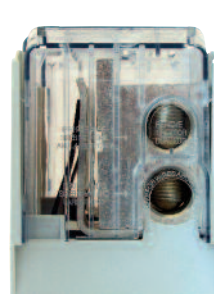
Optional 400A Class J Version (JM60400- MW22)

††For Class J 400A double box lug configuration, optional cover provides IP20 finger-safe protection for dual 350kcmil-1 AWG wires or one single 350kcmil-6 AWG wire.