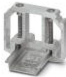
End clamp, for end support of UKH 50 to UKH 240, is pushed onto DIN rail NS 35 and fixed with 2 screws, width: 10 mm, color: aluminum