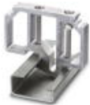
End clamp, for end support of UKH 50 - UKH 240, is pushed onto DIN rail NS 32 and fixed with 2 screws, width: 10 mm, color: Aluminum