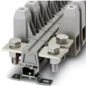
Universal terminal block with bolt connection, cross section: 70 - 240 mm 2 , width: 53 mm, color: gray

Please be informed that the data shown in this PDF Document is generated from our Online Catalog. Please find the complete data in the user's documentation. Our General Terms of Use for Downloads are valid ( http://download.phoenixcontact.com )