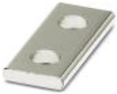
Connection rail, Color: silver