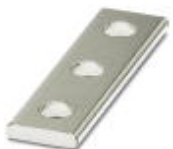
Connection rail, Color: silver