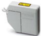
Covering hood, Width: 49.8 mm, Height: 77 mm, Color: gray