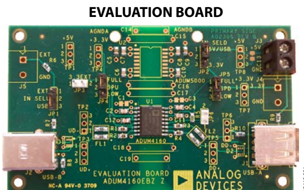
Figure 1. USB Evaluation Board

The evaluation board allows configuration of all of the features of the ADuM4160/ADuM3160 chip and provides support for a variety of possible power schemes. The board also allows common-mode voltages; however, it is not recommended for performing safety related testing, such as high voltage withstand testing. Perform this type of testing on the component level or on a production board.