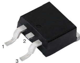
D 2 PAK (TO-263AB)