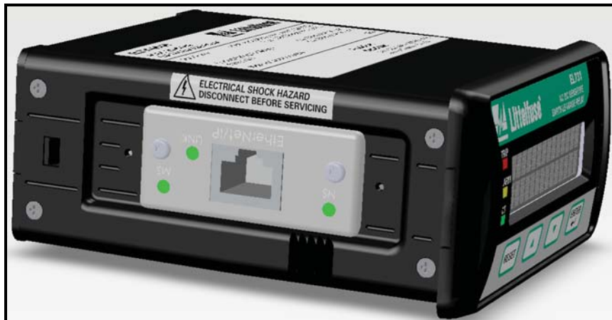
FIGURE 4. Ethernet/IP Communications Module (AC700-CUA-03) installed in an EL731.