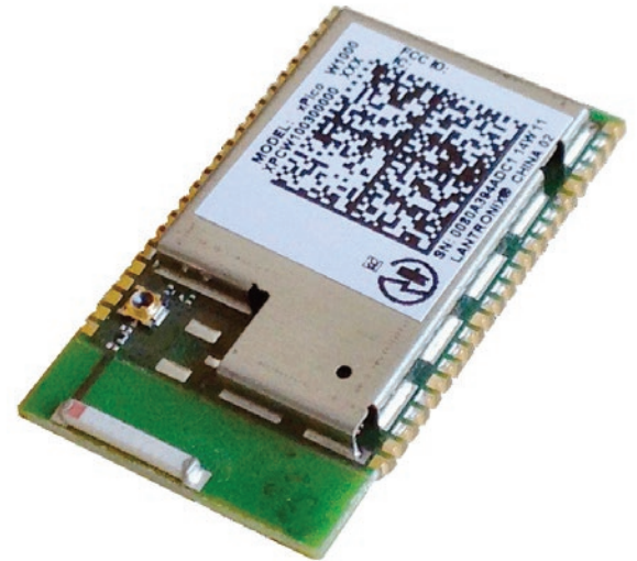
*XPC W1003 version shown

As an innovative, mobile ready solution, the Lantronix® xPico® Wi-Fi® SMT device server sets new standards for its customers by enabling IoT applications that deliver highly desired smartphone and tablet functionality. Once complex, now Wi-Fi implementation is greatly simplified with xPico Wi-Fi SMT's unique and robust feature set including; simultaneous Soft AP and client mode, zero host load, and configuration by customization. These along with Lantronix' commitment to reliability, quality and ease of use, supports developers to quickly leverage mobile solutions for their applications, while reducing their total cost of ownership across their products life cycle.