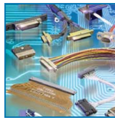
Microdot Connectors and Cables