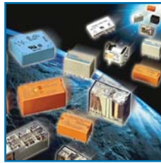
Schrack PCB Relays