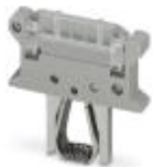
Isolating connector, for using the base fuse terminal block as plug disconnect terminal block