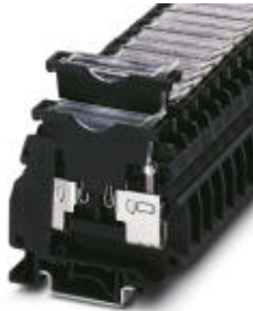
Fuse terminal block, cross section: 0.5 - 16 mm 2 , AWG: 18 - 8, width: 10.2 mm, color: black

Please be informed that the data shown in this PDF Document is generated from our Online Catalog. Please find the complete data in the user's documentation. Our General Terms of Use for Downloads are valid ( http://download.phoenixcontact.com )