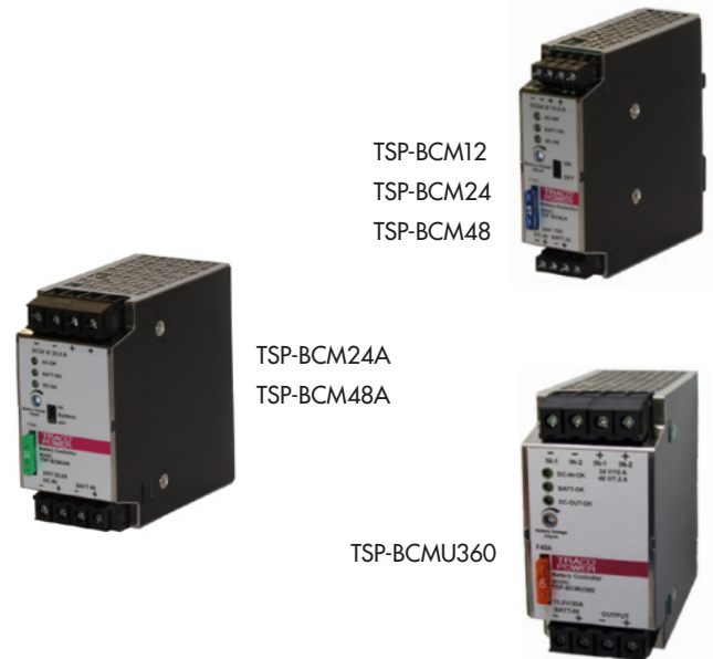
TSP-BCM12 TSP-BCM24 TSP-BCM48