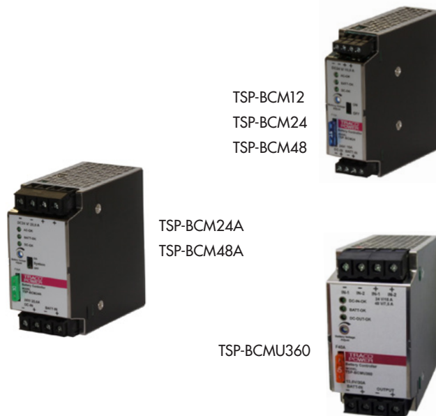
TSP-BCM12 TSP-BCM24 TSP-BCM48