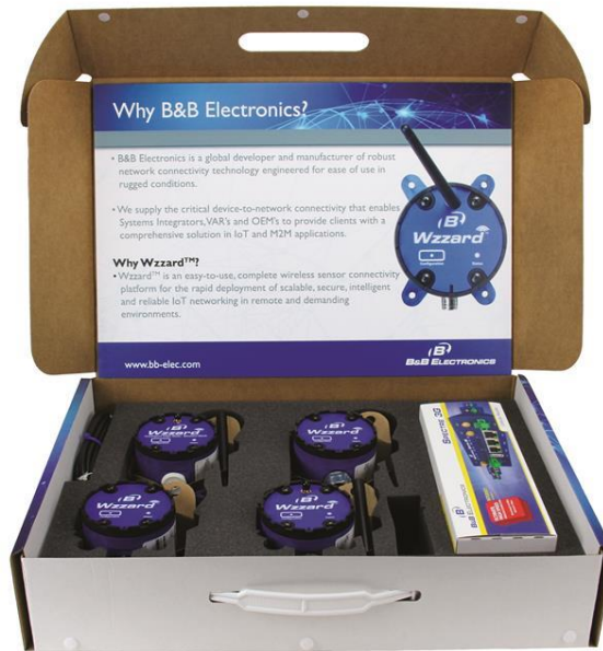
Figure 1. Wzzard Development Kit

B&B has preselected the contents of the design and development kits. One provides cellular and Ethernet network connections. The other provides an Ethernet network connection. The kits include a Spectre Network Gateway, and M12 cable and (4) Intelligent Edge Nodes. (Additional Nodes may be purchased to build a larger network). The Nodes provide the sensor interface connection to all of the options provided by the Wzzard system; analog input, digital input, integrated accelerometer and thermocouple input. All Nodes also contain an integrated temperature sensor. Nodes have multiple cabling options: conduit fitting and M12 connections. Additionally, two of the Nodes are supplied with external antennas and two with internal antennas, allowing you to test for range with both options. Kit contents are described below: