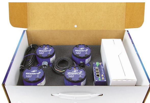
Figure 3. Repackaging the Development Kit

The package allows you to repackage the contents. By simply removing the middle foam section and removing the foam inserts, Nodes and Gateways can be easily repackaged. Accessories can be placed within the Gateway box. See below: