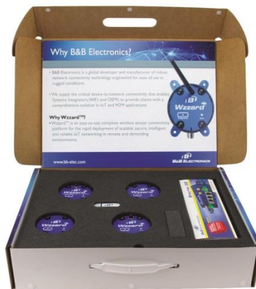
Figure 2. Package Contents

The Wzzard Design and Development Kits come in an enclosure. The contents of the package are shown below: