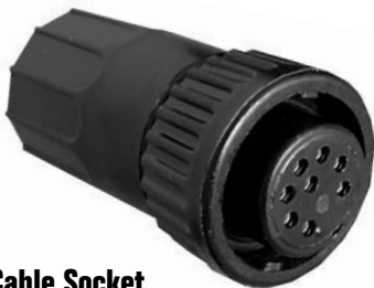
Cable Socket 3X8X-XSB-XXX Matching Mates: • Cable-Cable 5X8X-XPB-XXX • Panel 4XXX-XPB-XXX