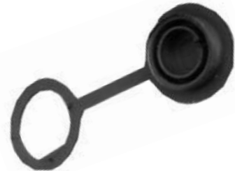
Dust Cap 6295