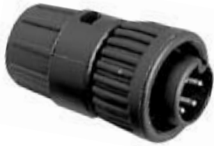
Cable Pin 6X8X-XPB-XXX Matching Mates: • Cable-Cable 8X8X-XSB-XXX • Panel 7XXX-XSB-XXX