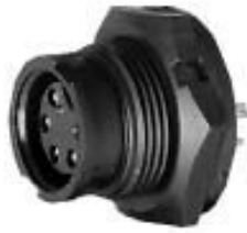
Panel Mount 7X8X-XXB-XXX Matching Mates: • Cable Pin 6X8X-XPB-XXX • Cable Socket 6X8X-XSB-XXX