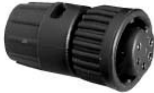
Cable Socket 6X8X-XSB-XXX Matching Mates: • Cable-Cable 8X8X-XPB-XXX • Panel 7XXX-XPB-XXX