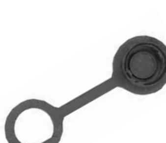
Dust Cap 16295