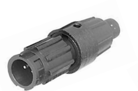
Cable to Cable 1828X-XXB-XXX Matching Mates: • Cable Pin 1628X-XPB-XXX • Cable Socket 1628X-XSB-XXX