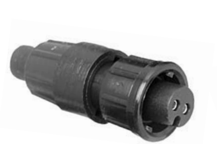
Cable Socket 1628X-XSB-XXX Matching Mates: • Cable-Cable 1828X-XPB-XXX • Panel 172XX-XPB-XXX