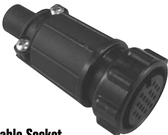
Cable Socket 13X8X-XXSG-XXX Matching Mates: • Cable-Cable 15X8X-XXPG-XXX • Panel 14XXX-XXPG-XXX