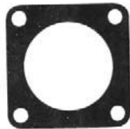
Square Flange Gasket 4297