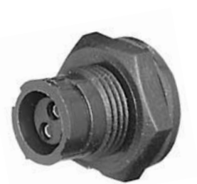
Panel Mount 1728X-XXB-XXX Matching Mates: • Cable Pin 1628X-XPB-XXX • Cable Socket 1628X-XSB-XXX