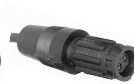
Cable to Cable