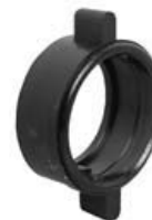
Winged Coupling Ring W/14482