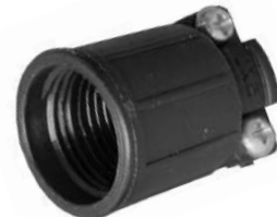
Mechanical Back Shell (Style #5)