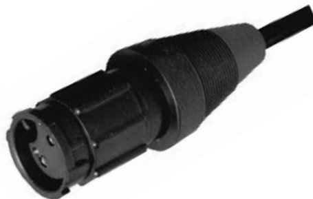
Cable to Cable