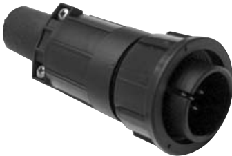
Cable Pin CXX 3106A XXXX XX P XXX