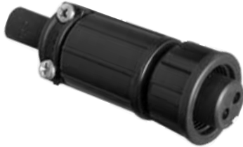
Cable Socket CXX 3106A XXXX XX S XXX