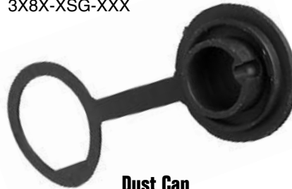
Dust Cap 4295