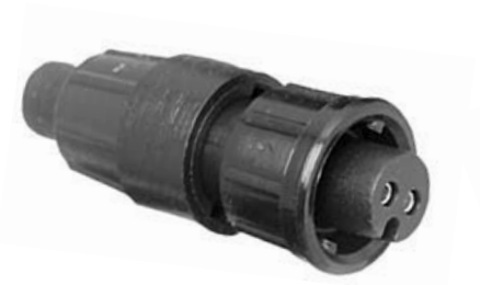
Cable Socket 1628X-XSB-XXX Matching Mates: • Cable-Cable 1828X-XPB-XXX • Panel 172XX-XPB-XXX