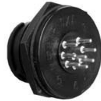
P/C Tail Panel Mount 4XXX-XXB-XXX Matching Mates: • Cable Pin 3X8X-XPB-XXX • Cable Socket 3X8X-XSB-XXX