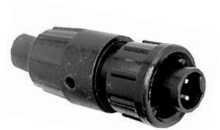
Cable Pin 1628X-XPB-XXX Matching Mates: • Cable-Cable 1828X-XSB-XXX • Panel 172XX-XSB-XXX