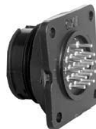
P/C Tail Panel Mount 14XXX-XXXG-XXX Matching Mates: • Cable Pin 13X8X-XXPG-XXX • Cable Socket 13X8X-XXSG-XXX