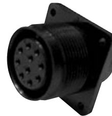
Box Receptacle Socket CXX 3102A XXXX XX S XXX