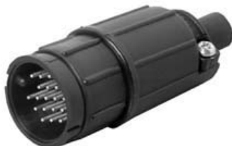
Cable to Cable 15X8X-XXXG-XXX Matching Mates: • Cable Pin 13X8X-XXPG-XXX • Cable Socket 13X8X-XXSG-XXX