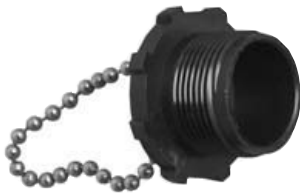
Cable Cap 4XX96