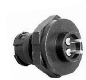
P/C Tail Panel Mount 172XX-XXB-XXX Matching Mates: • Cable Pin 1628X-XPB-XXX • Cable Socket 1628X-XSB-XXX