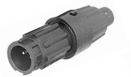
Cable to Cable 1828X-XXB-XXX Matching Mates: • Cable Pin 1628X-XPB-XXX • Cable Socket 1628X-XSB-XXX