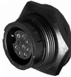
Panel Mount 4X8X-XXB-XXX Matching Mates: • Cable Pin 3X8X-XPB-XXX • Cable Socket 3X8X-XSB-XXX