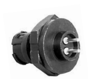
P/C Tail Panel Mount 172XX-XXB-XXX Matching Mates: • Cable Pin 1628X-XPB-XXX • Cable Socket 1628X-XSB-XXX