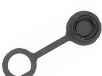
Dust Cap 16295