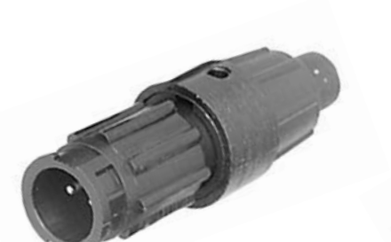
Cable to Cable 1828X-XXB-XXX Matching Mates: • Cable Pin 1628X-XPB-XXX • Cable Socket 1628X-XSB-XXX