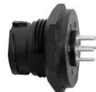
P/C Tail Panel Mount 7XXX-XXB-XXX Matching Mates: • Cable Pin 6X8X-XPB-XXX • Cable Socket 6X8X-XSB-XXX