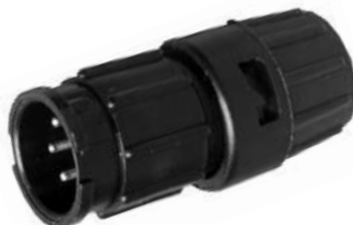
Cable to Cable 8X8X-XXB-XXX Matching Mates: • Cable Pin 6X8X-XPB-XXX • Cable Socket 6X8X-XSB-XXX