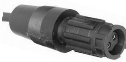
Cable to Cable