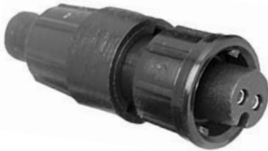
Cable Socket 1628X-XSB-XXX Matching Mates: • Cable-Cable 1828X-XPB-XXX • Panel 172XX-XPB-XXX