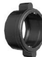
Winged Coupling Ring W/4482