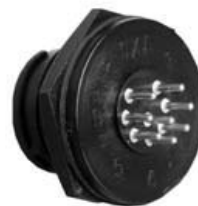
P/C Tail Panel Mount 4XXX-XXB-XXX Matching Mates: • Cable Pin 3X8X-XPB-XXX • Cable Socket 3X8X-XSB-XXX