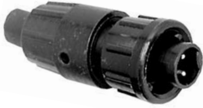
Cable Pin 1628X-XPB-XXX Matching Mates: • Cable-Cable 1828X-XSB-XXX • Panel 172XX-XSB-XXX