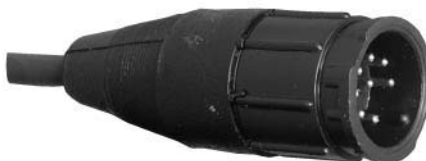
Cable to Cable