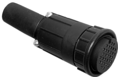
Cable Socket 23X8X-XXSG-XXX Matching Mate: • Panel 24XXX-XXPG-XXX