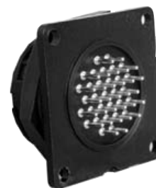
P/C Tail Panel Mount 24XXX-XXXG-XXX Matching Mates: • Cable Pin 23X8X-XXPG-XXX • Cable Socket 23X8X-XXSG-XXX