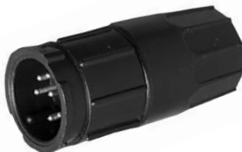
Cable to Cable 5X8X-XXB-XXX Matching Mates: • Cable Pin 3X8X-XPB-XXX • Cable Socket 3X8X-XSB-XXX