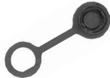
Dust Cap 16295