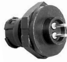
P/C Tail Panel Mount 172XX-XXB-XXX Matching Mates: • Cable Pin 1628X-XPB-XXX • Cable Socket 1628X-XSB-XXX