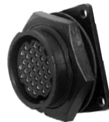
Panel Mount 24XXX-XXXG-XXX Matching Mates: • Cable Pin 23X8X-XXPG-XXX • Cable Socket 23X8X-XXSG-XXX