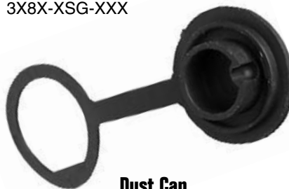
Dust Cap 4295