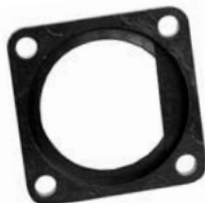
Square Flange Adapter 4296