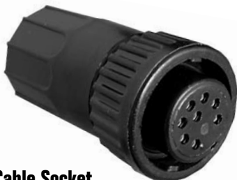
Cable Socket 3X8X-XSB-XXX Matching Mates: • Cable-Cable 5X8X-XPB-XXX • Panel 4XXX-XPB-XXX