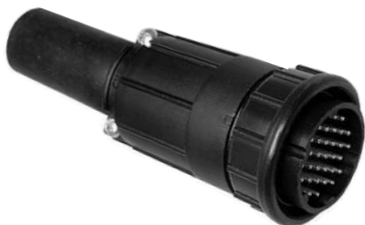
Cable Pin 23X8X-XXPG-XXX Matching Mate: • Panel 24XXX-XXSG-XXX