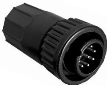
Cable Pin 3X8X-XPB-XXX Matching Mates: • Cable-Cable 5X8X-XSB-XXX • Panel 4XXX-XSB-XXX