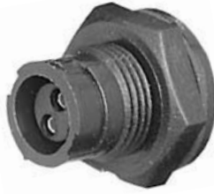
Panel Mount 1728X-XXB-XXX Matching Mates: • Cable Pin 1628X-XPB-XXX • Cable Socket 1628X-XSB-XXX