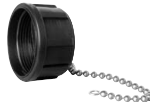
Receptacle Cap 4XX95