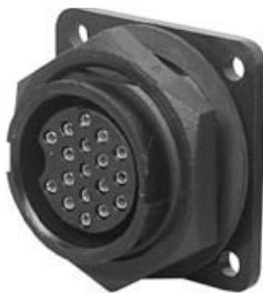
Panel Mount 14X8X-XXXG-XXX Matching Mates: • Cable Pin 13X8X-XXPG-XXX • Cable Socket 13X8X-XXSG-XXX