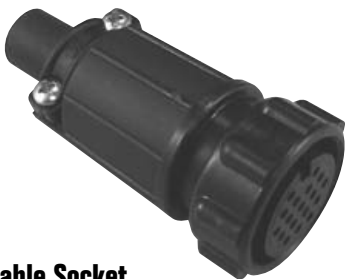
Cable Socket 13X8X-XXSG-XXX Matching Mates: • Cable-Cable 15X8X-XXPG-XXX • Panel 14XXX-XXPG-XXX