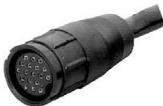
Cable to Cable