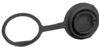
Dust Cap 14295