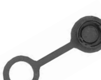
Dust Cap 16295