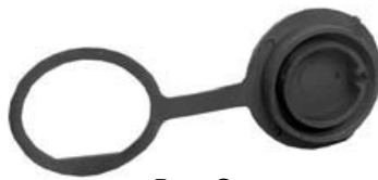
Dust Cap 14295