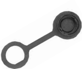
Dust Cap 16295