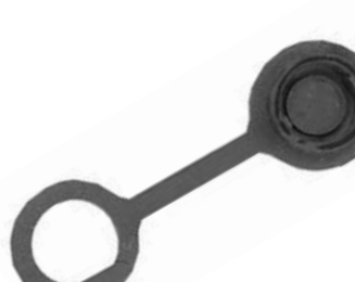
Dust Cap 16295