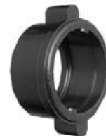
Winged Coupling Ring W/4482