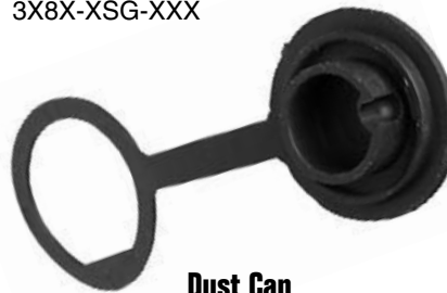
Dust Cap 4295