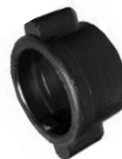
Winged Coupling Ring W/6482