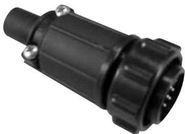
Cable Pin 13X8X-XXPG-XXX Matching Mates: • Cable-Cable 15X8X-XXSG-XXX • Panel 14XXX-XXSG-XXX