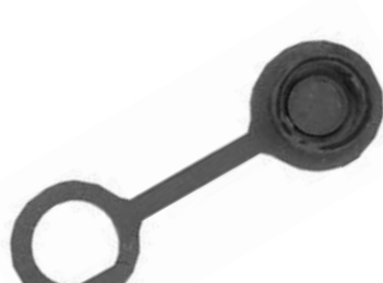
Dust Cap 16295