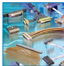
Microdot Connectors and Cables