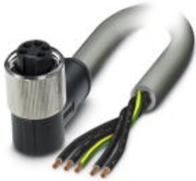
Power cable, 5-pos., gray PVC, 2.5 mm 2 , free cable end to angled 7/8" 16UNF socket, length: 3.0 m

Please be informed that the data shown in this PDF Document is generated from our Online Catalog. Please find the complete data in the user's documentation. Our General Terms of Use for Downloads are valid ( http://download.phoenixcontact.com )